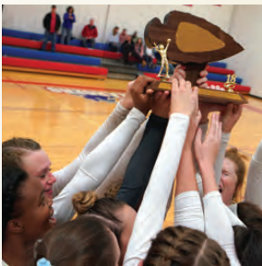
Sandburg Athletics Enjoys Historic Year